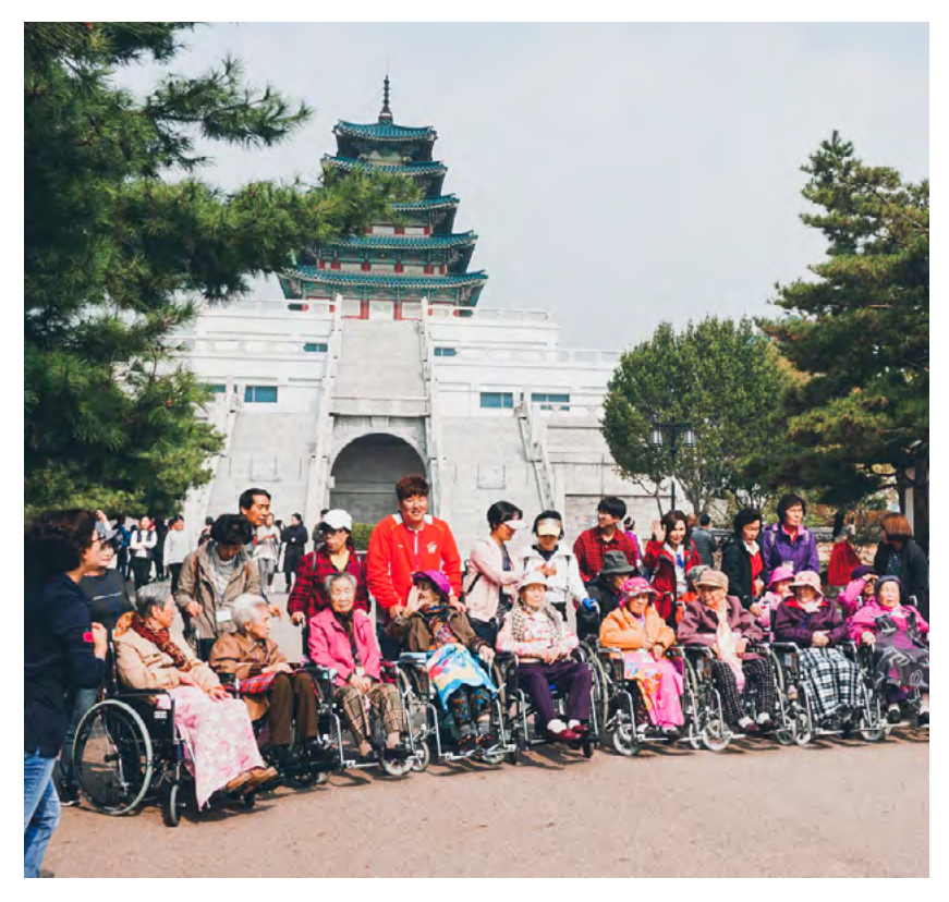
Seoul, Republic of Korea

In Canada, the regional government of Ontario implemented a Basic Income Pilot Project already in 2016 "to test a growing view at home and abroad that basic income could provide a new approach to reducing poverty in a sustainable way".<sup>19</sup> The program ensures a minimum income level regardless of employment status to a group of around 4,000 people. Pilot locations where the project is being run include: