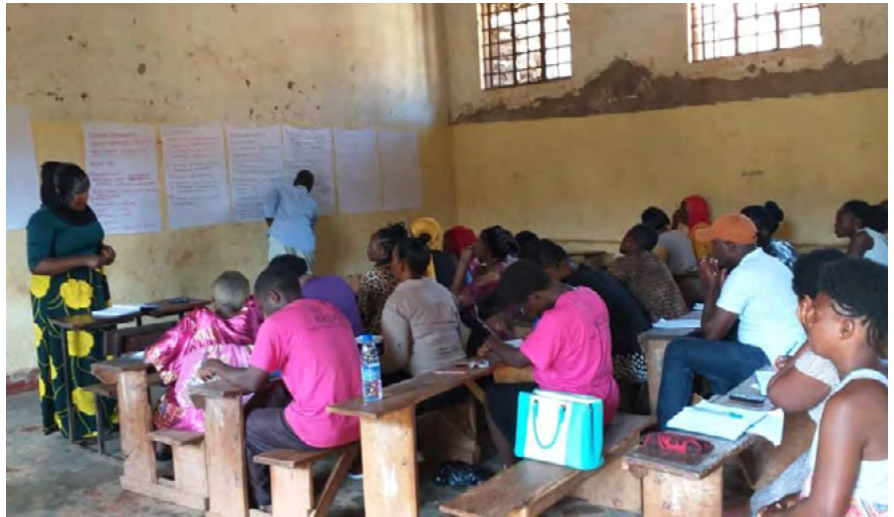
Community groups in a capacity building training on business proposal writing

Kampala Capital City Authority's (KCCA) approach to solid waste management is hinged on a public private partnership (PPP) mechanism. Several evaluation reports about the approach in the city consider it environmentally unfriendly and costly to both KCCA and urban poor communities, which requires redress. This underscores the importance of effective and sustainable waste management systems across the city region. Alternative means of waste management are not only likely to reduce waste management costs, environmental impacts but also provide alternative sources of income to the urban poor, despite the fact that they still lack a supporting policy and legal framework. With over 60% of the population considered as poor in Kampala City, the KNOW Kampala project was designed to: (1) co-produce knowledge on how to identify