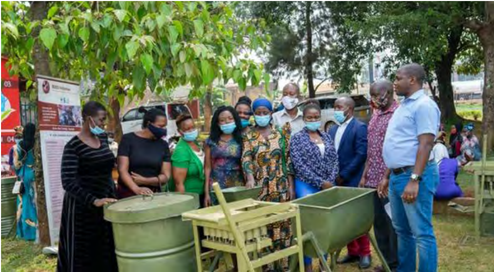
Exodus group receiving their equipment

towards integrating the urban poor into the urban economy . Many residents in informal settlements coalesce around loose forms of savings and self help groups. Most of the community skills training activities took advantage of the village savings and loan schemes; an initiative that is built on the structure of the National Slum Dwellers Federation (NSDF).