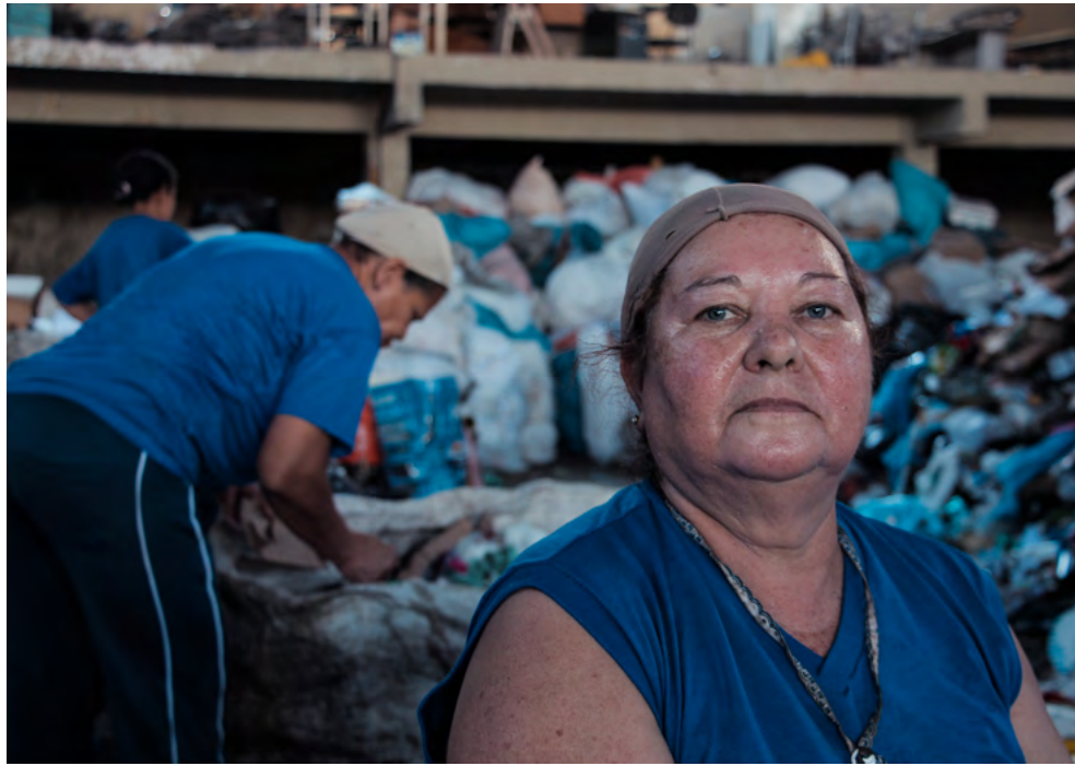
Waste picker cooperative in Belo Horizonte (Brazil).

It is worth noting that discussions on alternative models of solid waste management and community based projects , such as Zero Waste initiatives, have also emerged in the Forum. Civil society actors, who happen to participate in the Forum, have worked together on the Zero Waste Project 8 in the Santa Tereza neighbourhood of Belo Horizonte for the past four years. The community based initiative includes services around food composting, a food coop system, a vegetable garden, a drop off site for recyclables, and campaigns for raising environmental awareness. These activities are ultimately foreground on supporting livelihoods and promoting environmental consciousness.