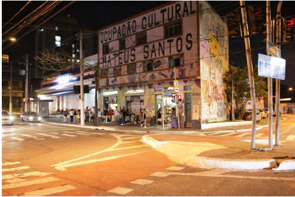
Mateus Santos Cultural Occupation, at Ermelino Matarazzo District, in 2019

That demand came from the understanding that the dialogue with the central administration would be more effective than with the Subprefecture administration. The demand for transferring the Culture houses to the MSC was met and proved to be quite correct, with the Culture Houses returning to play a significant role, even if still very limited, in the city's cultural fruition, as opposed to the previous situation, in which they were used as political currency by local managers and often were abandoned and working precariously. This precedent contributed to the OB's strategy to also privilege the dialogue with the MSC instead of leaving each space to dialogue separately with the Subprefecture's administration. For this reason, and to be recognised as cultural spaces, one of the main demands of the OB is to transfer the ownership of the occupied public spaces to the MSC's administration.