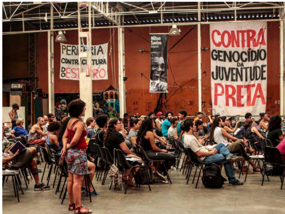
Periphery Insurgencies: The city we want. Seminar organized by the Cultural Movement of the Peripheries at Sacolão das Artes cultural occupation, expropriated in 2018